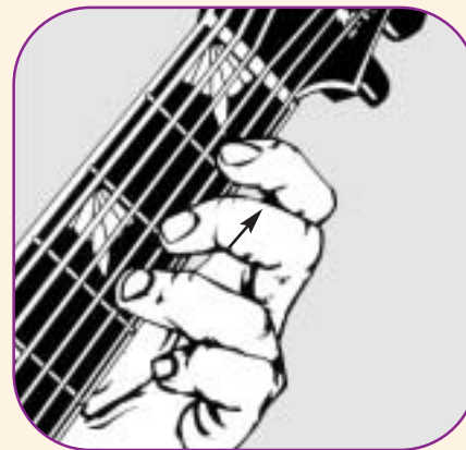
D (3rd Fret)