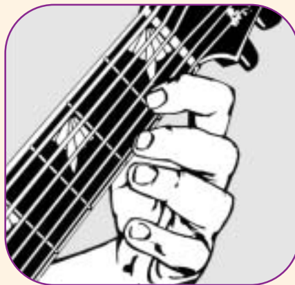
C (1st Fret)